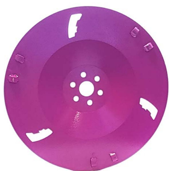
Purple PCD Thick glue & membranes