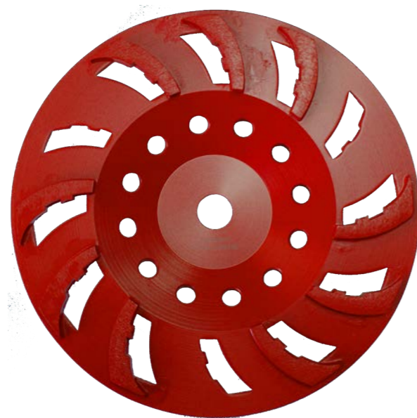
Dark Red Agressive removal of soft concrete