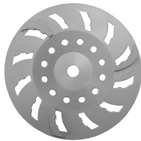
Grey Paint and glue removal