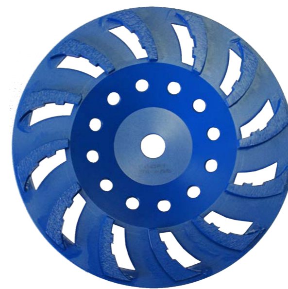
Blue Very soft or abrasive concrete