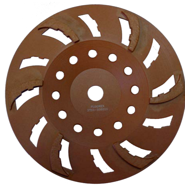
Brown Agressive general purpose