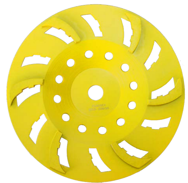
Yellow Very fine grinding and honing